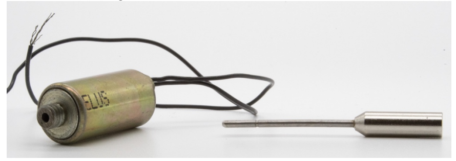
Combined, it looks like this:

A metal rod is placed inside the coil. The thick end of that rod sits inside the coil; the thin end extends into the cylinder through the hole. The plastic cover prevents the rod from falling out when the magnet is off.